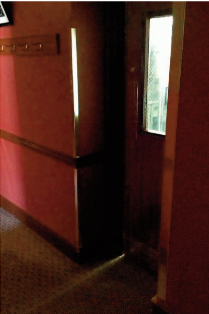
Custom fabrication and installation of brass corner guards