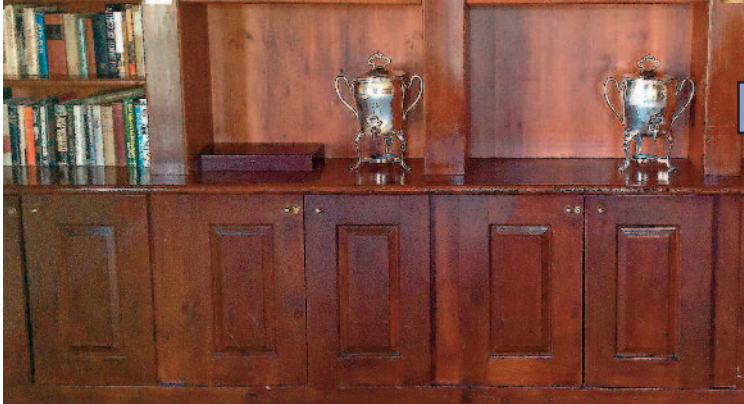
Coat Rooms: Painting to match current building themes