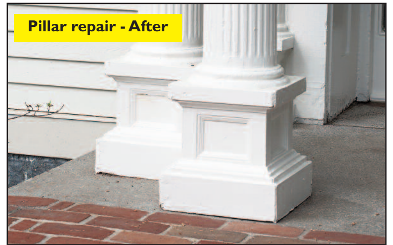
Pillar repair - After