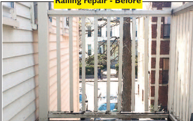
Railing repair - Before