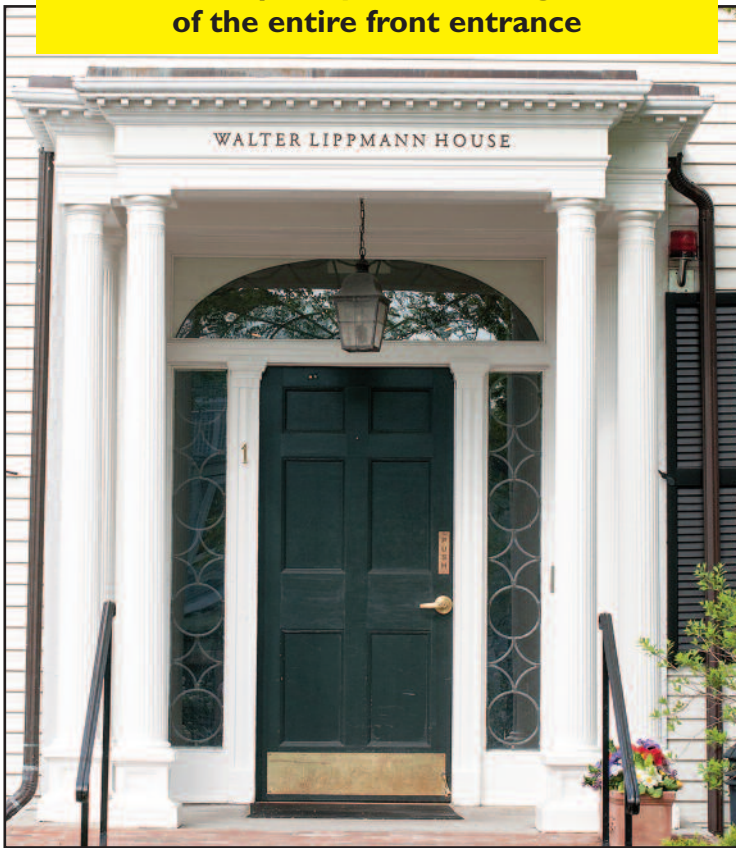
Carpentry and Painting of the entire front entrance