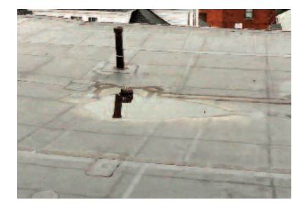
Ponding, a problem on flat roofs, is likely to lead to leaks and is typically symptomatic of additional roofing problems.