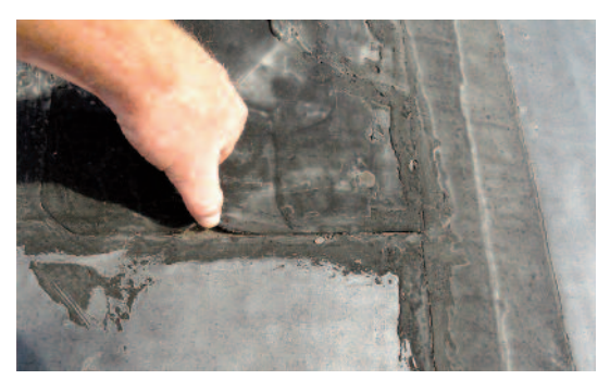
Inspections usually start at the seams where water penetrations can occur

little maintenance and will last for years without needing repair or replacement. When a puncture occurs or a seam separates, water will begin to leak through the rubber, and a solid and permanent repair must be done to correct the problem. RM Cochran is proficient at identifying and repairing rubber roof leaks and can assist you with these needs.