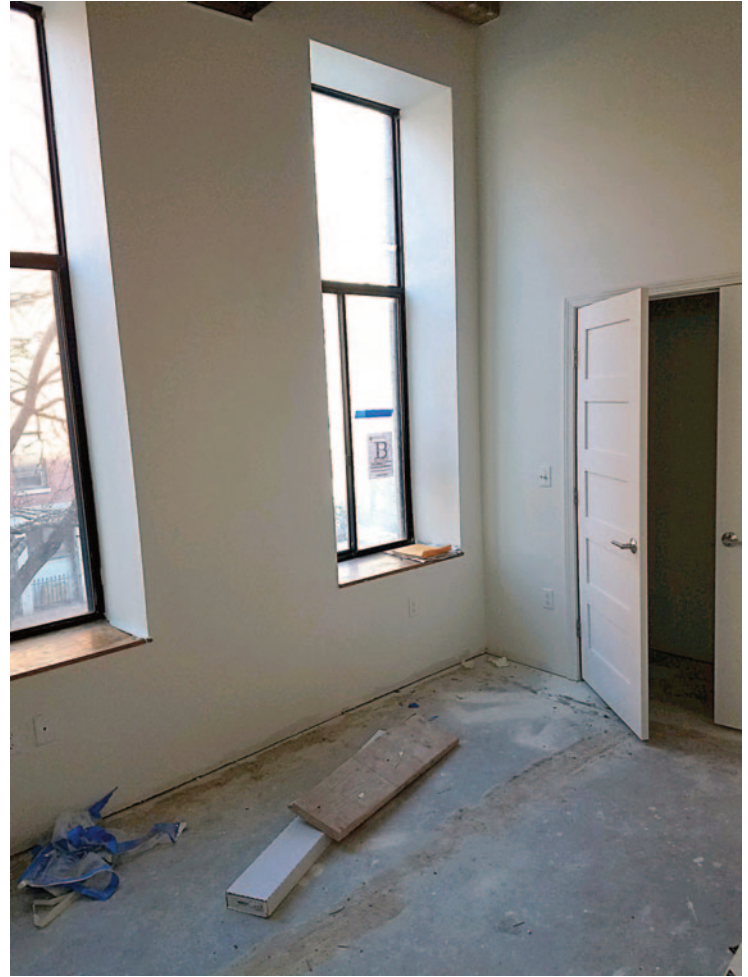
A few of the units with the painting almost complete.