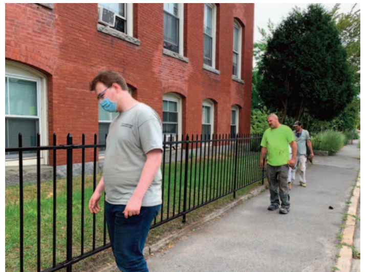
The RMC team is dedicated to quality. After every step, our team reviews the finished product for the quality we demand.