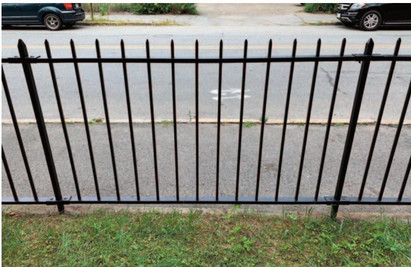
The black iron fence required restoration. Sanding, painting and a little bit of welding.