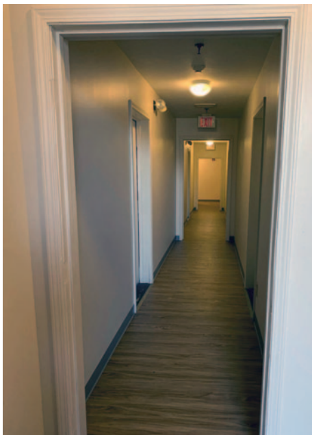
The interior common areas received new flooring and a paint job.