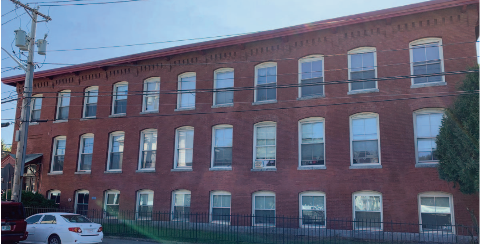
RM Cochran performed brick and mortar repairs on this historic property.

RM Cochran partnered with CGDC and Peabody Properties to develop a plan for updating and repairing their three building cluster located at 420, 423, and 430 Broadway Street in Lowell, MA. This multi-month project includes interior and exterior work and is projected to be completed in March of 2021.