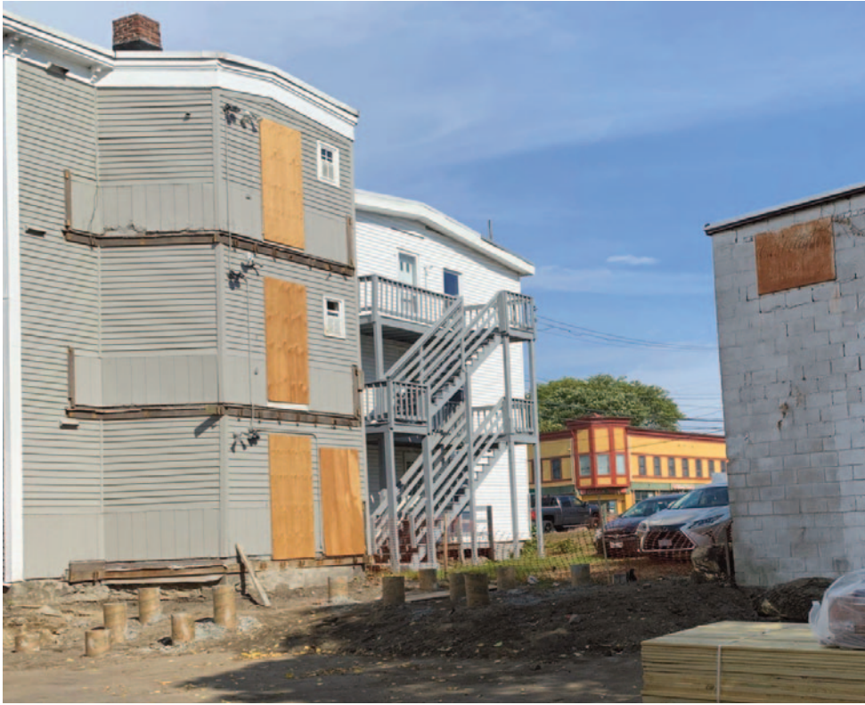
420 Broadway Street is having its 3 story rear stairs rebuilt. In this picture you can see the new footings poured and curing.