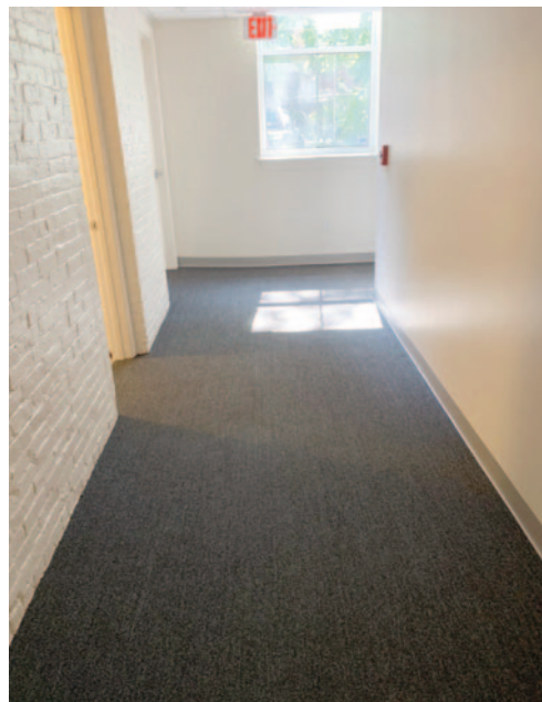
The first floor common area at 430 Broadway Street received carpeting and paint.