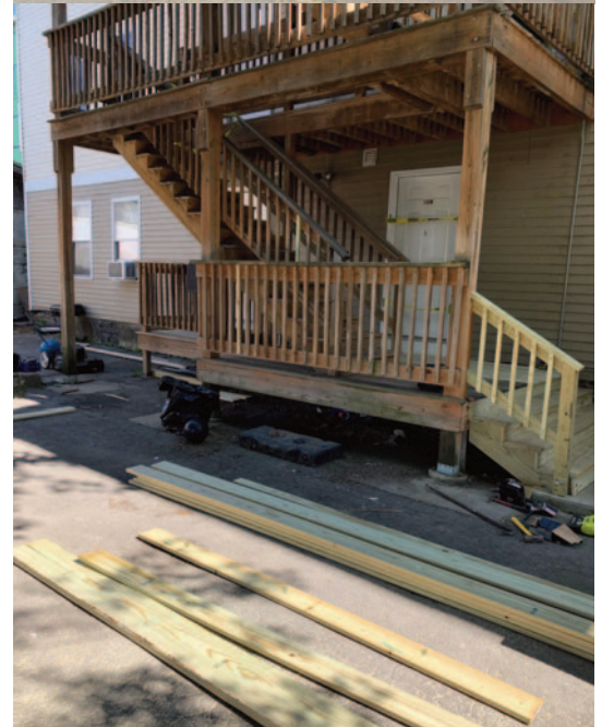
The side porch at 423 Broadway Street were partially rebuilt.